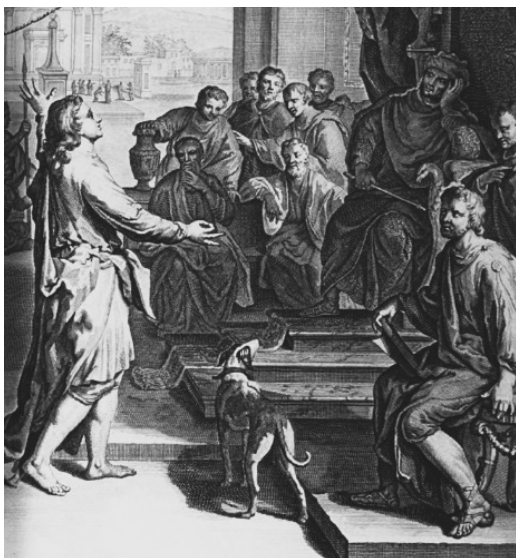
Joseph Explains Pharaoh's Dream to Him (detail), from Figures de la Bible (1728)