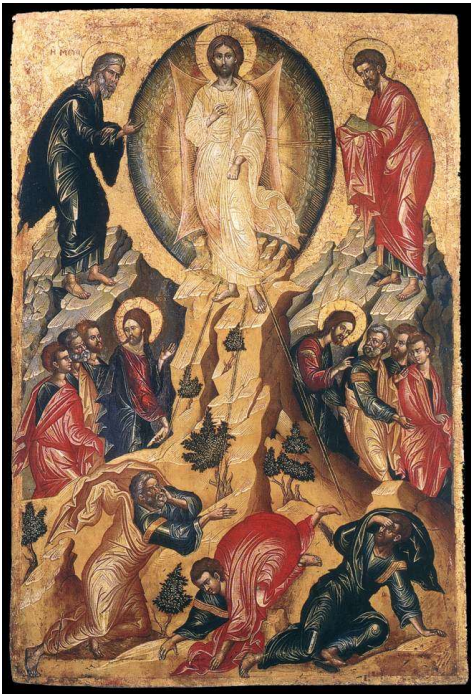
The Transfiguration of Christ (c.1550)