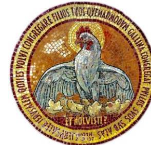
Mosaic from altar front of the Church of Dominus Flevis, Jerusalem (1955)