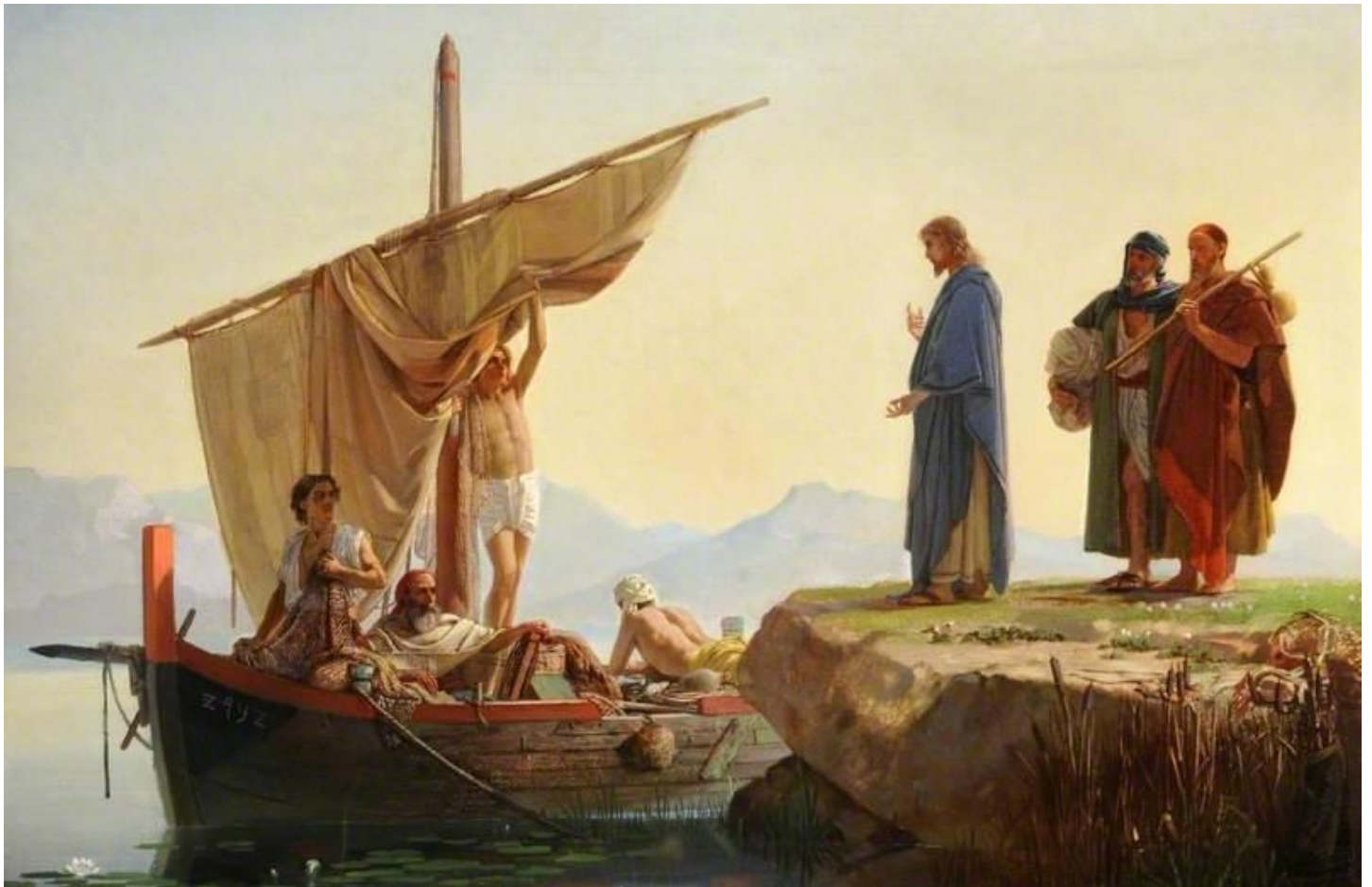
Christ Calling the Apostles James and John, Edward Armitage (1817-1896)