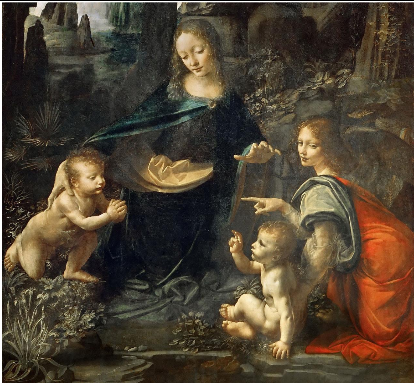
Adoration of the Christ Child by St John the Baptist (Virgin of the Rocks). Leonardo da Vinci (1452-1519)