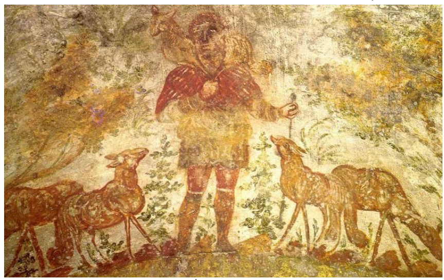
Christ the Good Shepherd, 3<sup>rd</sup> century – Catacomb of Domatilla, Rome

THE ANGLO-CATHOLIC PARISH IN THE DIOCESE OF OTTAWA CELEBRATING 130 YEARS OF WORSHIP AND SERVICE, 1889-2019