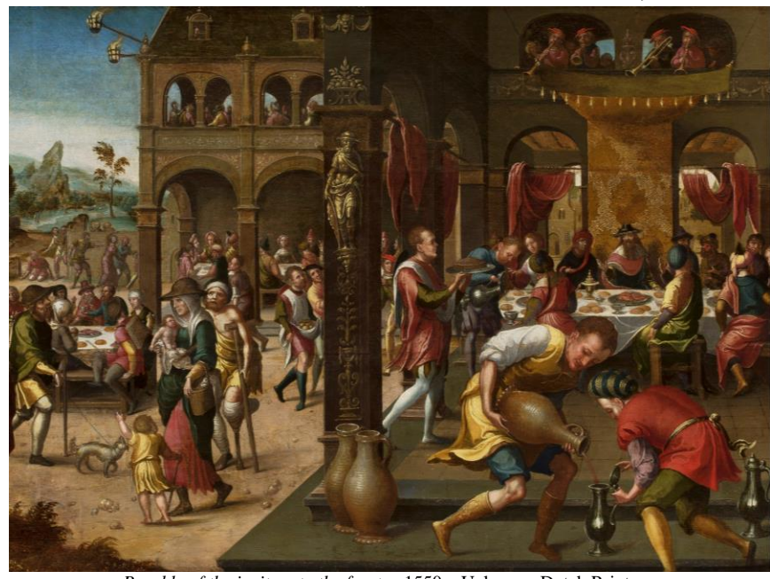
Parable of the invitees to the feast, c.1550 - Unknown Dutch Painter

THE ANGLO-CATHOLIC PARISH IN THE DIOCESE OF OTTAWA CELEBRATING 130 YEARS OF WORSHIP AND SERVICE, 1889-2019