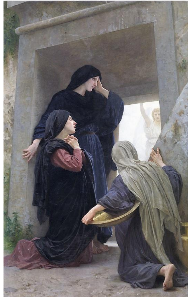
Les saintes femmes au tombeau (1890) - William-Adolphe Bouguereau (1825-1905)

THE ANGLO-CATHOLIC PARISH IN THE DIOCESE OF OTTAWA CELEBRATING 130 YEARS OF WORSHIP AND SERVICE, 1889-2019